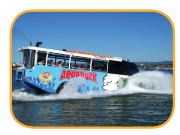
Aqua Duck Cruise Gold Coast without leaving your seat. Simply kick back and enjoy the journey. Great pre-race tour!