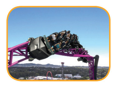
Thrilling Rides Live life on the edge with high velocity rides at the theme parks.