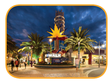
Shopping Make sure you schedule at least half a day at the newly expanded Harbour Town to scoop heavily discounted sporting and fashion apparel!