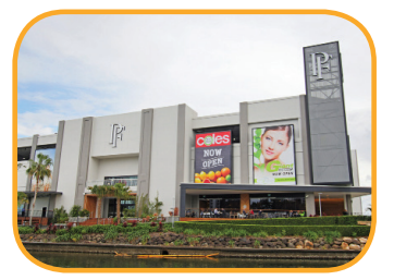
Pacific Fair Newly renovated with approximately 420 shops, restaurants and entertainment destinations under one roof.