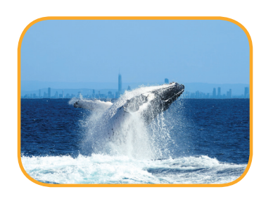
Up Close with Humpback Whales Catch the humpback whales on their annual winter pilgrimage from the Antarctic to warmer oceans.