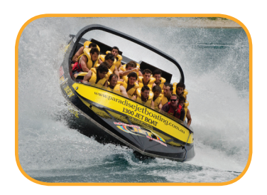
Go Jetboating Go Jetboating and experience a rollercoaster on water!

Gold Coast is Australia's favourite playground of entertainment and adventure. Feel the excitement of life in the fun lane, where the sun shines, the surf's up and you're spoilt for choice with an endless variety of things to see and do all year round. We show you how to have good fun in famous Gold Coast post-run!